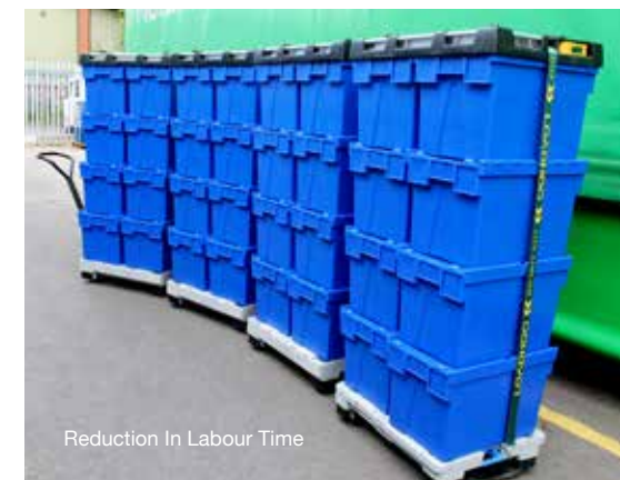
Reduction In Labour Time