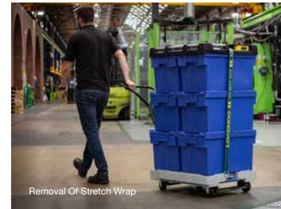
Removal Of Stretch Wrap

Increased Safety With no stretch wrap hazards within the operation, safety has been improved throughout the supply chain.