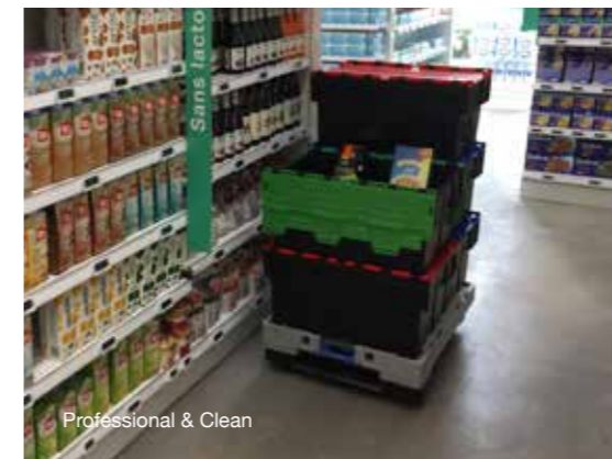
Professional & Clean

The product is clean and professional in store making the company more presentable and less of a hindrance to our customers.